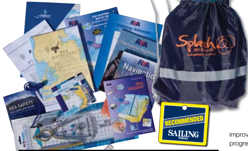
The impressive course pack that comes included from Splash.

Once signed up for the course, we were quickly introduced to our online tutor, John Kelso, who would also be our assessor and source of encouragement right through to completion. Our login details were emailed to access the course syllabus, so all we were waiting for was our pack of 'goodies', which arrived the following morning. Like two over excited children on Christmas morning, we sat cross-legged on the floor (can still just about manage such athletic positions) diving into the bottomless sacks, taking out endless charts, books,