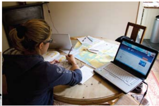
If you're brave enough to learn with your partner it can be very rewarding and help with motivation.

The point is that without any prior knowledge I would suggest doing the Essential Navigation course with Splash first, just to